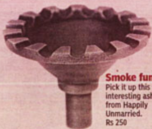
Smoke funnel Pick it up this interesting ashtray from Happily Unmarried. Rs 250