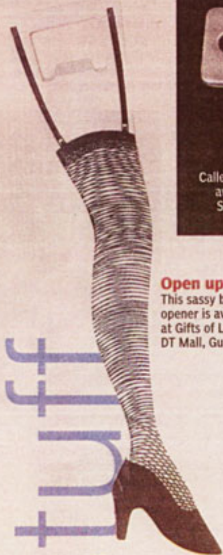
Open up This sassy bottle opener is available at Gifts of Love, DT Mall, Gurgaon

Fancy a game of futuristic chess? Pick up this brushed matte stainless steel set up from FCML Home, Khan Market. Rs 12,610