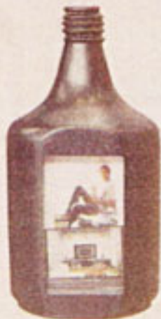
A potent shot Frame your favourite moments in this bottle, oops frame. Available at Happily Unmarried. Rs 450