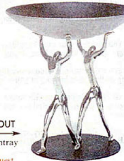
FIGURE IT OUT